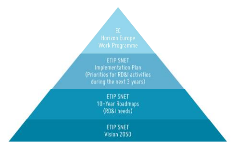
Fig 2. ETIP SNET Vision, Roadmaps and Implementation Plans as basis for EC Work Programmes [1]